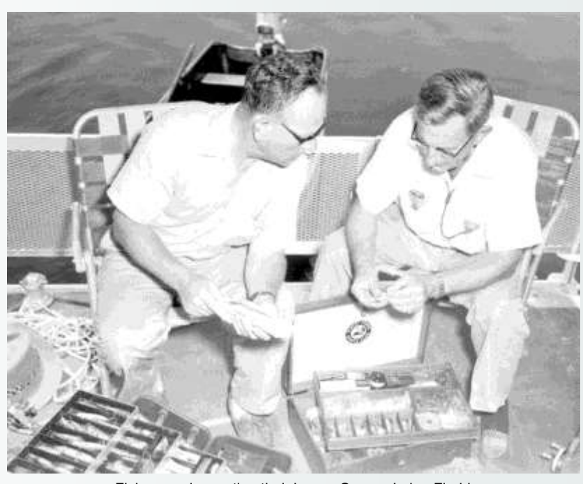
Fishermen inspecting their lures - Orange Lake, Florida 1959

January 9 -10, 2015 NFLCC Region 3 Winterfest Pigeon Forge, Tennessee